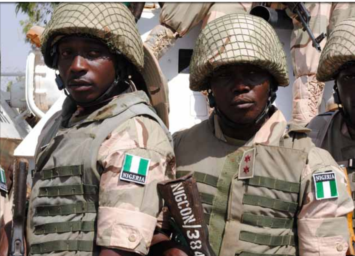
Nigerian troops, part of the ECOWAS force to push for emancipation of Northern Mali from Islamists, Jan. 2013.