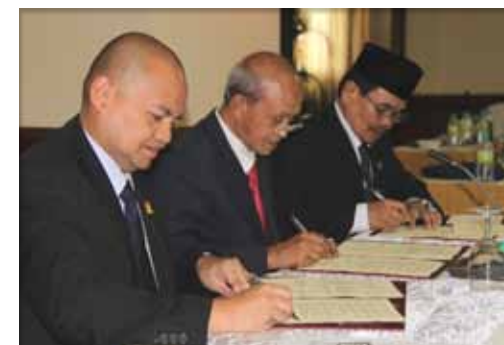
Signing of the 'GPH-MILF Decision Points on Principles', 24 April 2012.

As a result of the range of the HD Centre's work, the organisation has been able to provide a link between the national peace process and local people in the areas affected by the conflict. As the peace process has evolved, the HD Centre has strived to share information about the latest developments with a wider audience through public meetings and supporting the production of radio shows. In 2012, for example, the HD Centre supported the MTT in holding public meetings so people could hear more about the peace process and, through these meetings, managed to reach out directly to over 30 communities. Similarly, when there was a breakthrough at the 27 th round of Exploratory Talks in Kuala Lumpur which resulted in an initial agreement on the '10 Decision Points on Principles', the Government's Chief Negotiator was interviewed on the MTT radio show to explain the agreement to people. Locally, the HD Centre's support to mediators in the Tumikang Sama Sama also helped resolve over 15 violent conflicts.