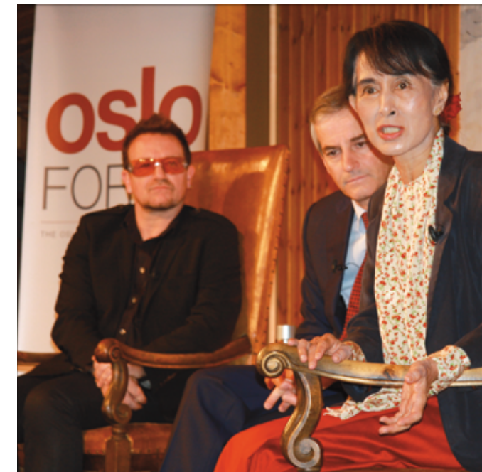
Bono, Norwegian Foreign Minister Jonas Gahr Store and Aung San Suu Kyi during the opening panel discussion.