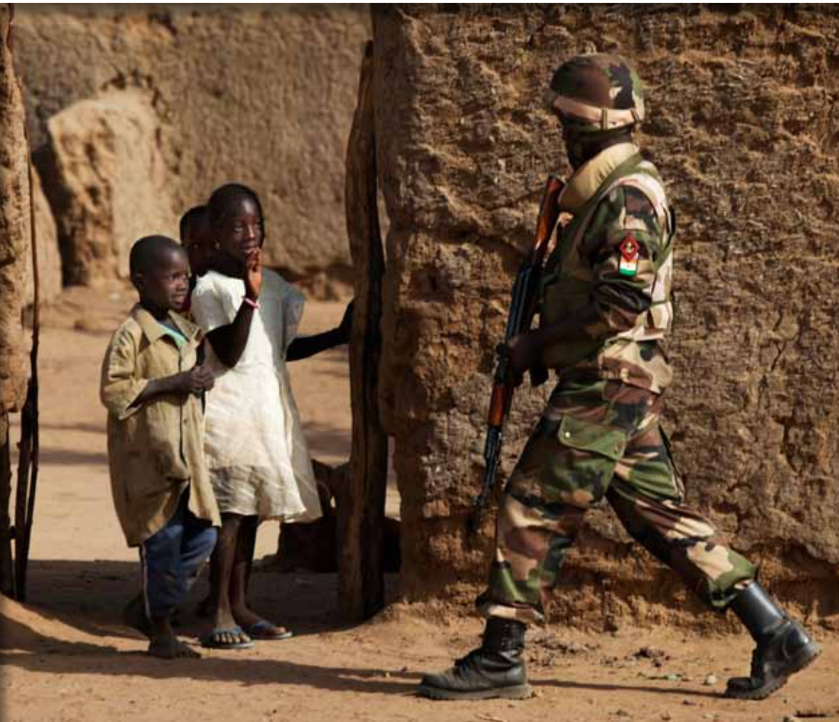
Children wave at a Niger soldier on patrol in Gao as part of the MISMA West African forces, Feb. 2013.

In 2012, plans were also developed for similar work in Plateau State in Nigeria, where the HD Centre aims to bring communities together to address long-standing grievances in order to seek a sustainable resolution to their conflict. Building on the HD Centre's experience in the mediation of long-standing, localised conflicts with national implications (such as in Kenya), the HD Centre has been building relationships with the key communities who have been engaged in, and affected by, the violence in Plateau state. By offering an impartial facilitation and mediation model that will enable the communities to build