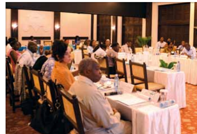
Peace process training course with members of the Kenyan Ministry of Foreign Affairs, December 2012.

In an effort to learn and share experiences with other mediation support actors, the HD Centre has also been an active member of the Mediation Support Network (MSN) over the last few years. This group of mediation support organisations meets regularly to share experiences and to discuss the latest information about successful mediation and peacemaking techniques. At the 2012 MSN meeting in Accra, participants discussed the collective response of member organisations to the UN's recently published 'Guidance for Effective Mediation', and were briefed on the collaboration in the field of conflict management between ECOWAS and civil society in West Africa.