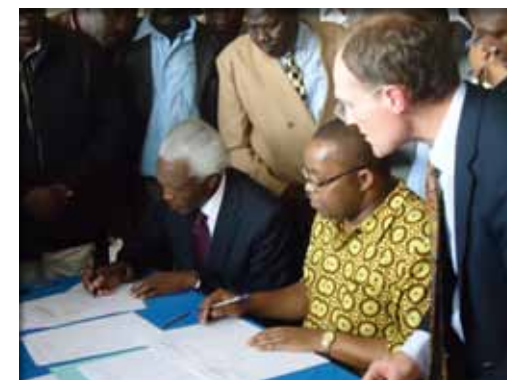
Signing of the 'Nakuru County Peace Accord', 19 Aug. 2012.

With Kenyan elections scheduled for March 2013, the NCIC and the HD Centre were very aware of the need to establish peace in Nakuru County in time to prevent tensions escalating around the elections. By the time the peace agreement – now named the Nakuru County Peace Accord – was finally signed on 19 August 2012, there were many people ready and willing to sign it.