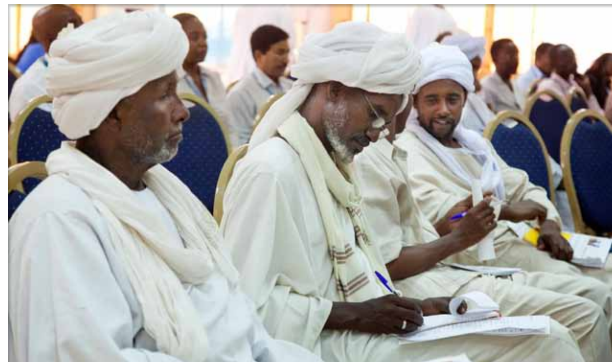
Humanitarian mediation workshop with Nomad Networks, Darfur, Sudan, April 2012.

the ground and improve humanitarian assistance in areas where conflict makes it difficult to access communities. The meetings have also helped the HD Centre to identify where it could make a valuable contribution to humanitarian efforts and the organisation has now established a humanitarian mediation project in one of the countries and developed its operational work in two of the other countries concerned following these discussions.