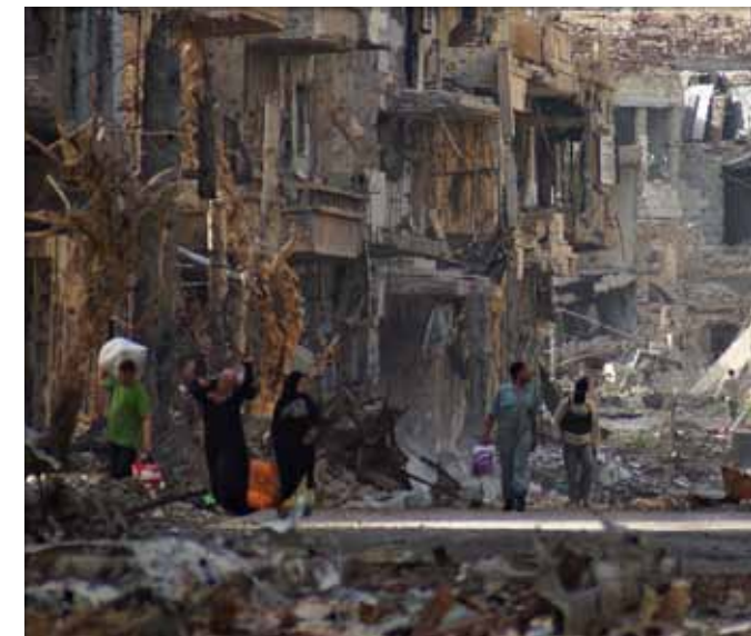
Residents walk along a street lined with damaged buildings, Deir al-Zor, April 2013.

In 2012, the HD Centre held workshops on the key concerns of Libyans during the transitional period.