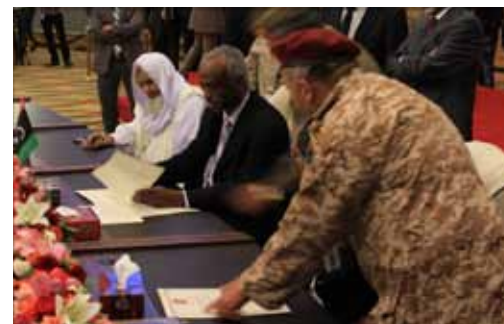
Signing of the 'Sabha Peace agreement' by Elders from Sabha, 20 April 2013.

Issues surrounding Libya's democratic transition also remain extremely divisive in the country, particularly the issues of lustration, the distribution of electoral seats, and the formation of the constituent assembly which will be responsible for drafting the constitution. Tensions have resulted in violent clashes and assaults on Libya's nascent democratic institutions. To develop dialogue between communities across the country, in 2012 the HD Centre held thirteen sub-national workshops and two national workshops on the key concerns of Libyans during this transitional period. These have involved more than 450 Libyans from over 30 towns