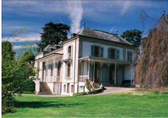
The Villa Plantamour, the HD Centre’s headquarters.

As a small organisation, the HD Centre is agile and adaptable. It can offer strategic support quickly and quietly as soon as it sees an opportunity to help. As a result of its extensive networks and unique combination of independence, experience, flexibility, impartiality and discretion, the HD Centre’s services are in high demand.