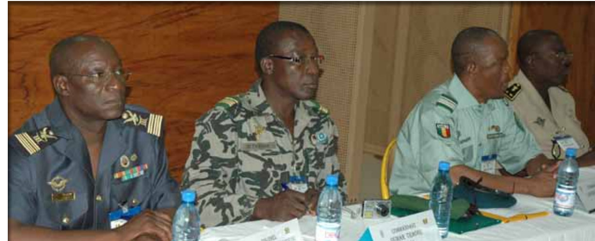
Bamako conference of army officials from Mali and other West African countries on conflict resolution, Oct. 2012.

To get a comprehensive picture of these communities' concerns, the HD Centre took care to ensure women and young people were involved in the dialogue process. To do this, the organisation drew on the experience of the Women's Reference Group on Mediation it has established through its Africa-wide "Women at the Peace Table" project and gathered those