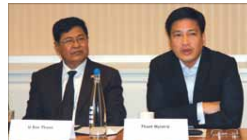
Myanmar Industry Minister, U Soe Thane (left), and historian and author, Thant Myint-U (right).

Having started in 2003, the forthcoming year also marks the Forum's tenth anniversary. The memorable highlights of 2012 have served to raise the standard of this important global event as it enters its second decade in 2013.