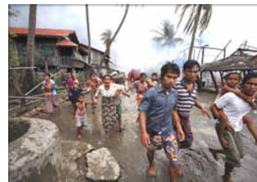
Rohingya run away from a fire set to a part of Sittwe, during clashes, 10 June 2012.

The Asia-Pacific project of the HD Centre's "Women at the Peace Table" programme, which aims to bring gender concerns into mainstream peacemaking in the region, also convened an Asia-wide roundtable in Nepal in 2012. Forty women from across Asia gathered together to discuss how gender could be considered in areas such as constitutional reform. A workshop was also held in Chiang Mai in Thailand which drew together Myanmar ethnic nationalities to discuss how gender issues could be included in peace processes in Myanmar (see 'Promoting women's participation throughout peace processes').