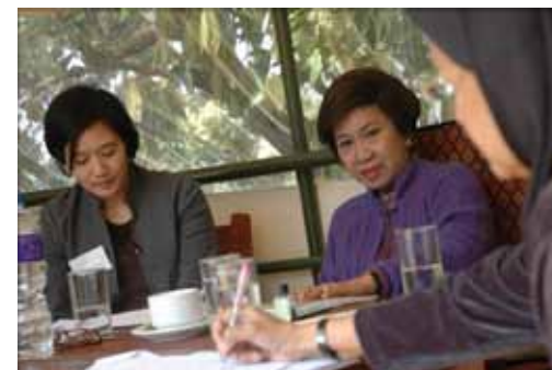
Participants at a regional dialogue roundtable in Nepal discuss the role of women in peace processes, March 2012.

To ensure the HD Centre also considers gender and the involvement of women in its own peacemaking projects, in 2012 the “Women at the Peace Table” Asia team provided advice to several projects within the organisation including on how gender could be considered in the design of peacemaking activities in Myanmar. The HD Centre also convened an “Experts Exchange Process Meeting” in Chiang Mai in Thailand to identify how organisations involved in supporting peace processes can consider gender issues in their work. Six members of the HD Centre's staff in Asia were also supported by ‘gender mentors’ who offered ongoing advice about incorporating gender concerns into their operational work. This pilot scheme has been so successful that other organisations are now considering setting up their own gender mentoring process.