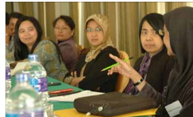
Participants at a regional dialogue roundtable in Nepal discuss the role of women in peace processes, March 2012.

In 2012, the focus shifted to identifying opportunities for women to become actively involved in all stages of the peacemaking process.