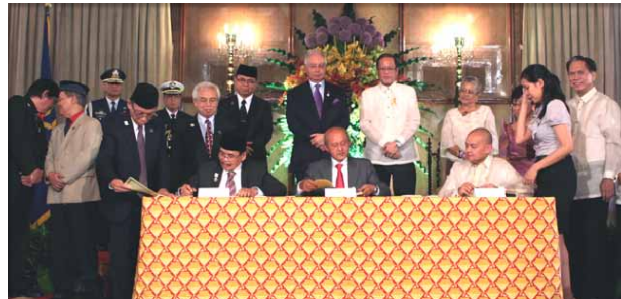
Signing of the Framework Agreement on the Bangsamoro, Manila, 15 Oct. 2012

Elsewhere in the region, the HD Centre supported Thailand's formal commitment to a dialogue process with representatives of the Patani Malay Liberation Movement, facilitated by Malaysia, which aims to address the ongoing conflict in southern Thailand. The HD Centre also established a country office in Myanmar with the goal of supporting the peace process between the