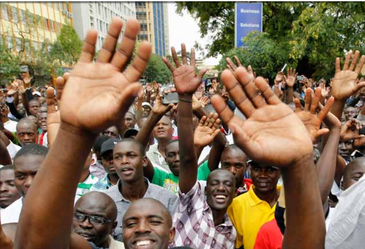
Supporters of Kenya's Prime Minister Raila Odinga cheer outside the Supreme Court in the capital Nairobi, 16 March 2013.

and implementation framework are very clear on the roles of women and youth as joint partners to the peace agreement.